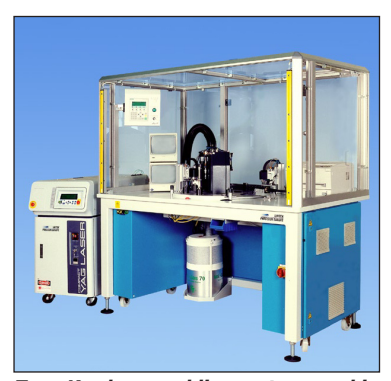
Turn-Key laser welding system combining welding with product testing for zero defect manufacturing.