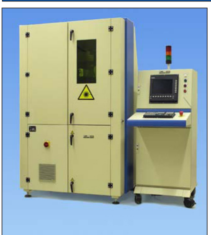
NOVA-T modular laser welding platform, configured for laser welding of Aluminum capacitor housings.