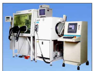
NOVA-CA and NOVA-G3 controlled atmosphere laser welding workstations for demanding applications in the medical and aerospace and defense electronics industries