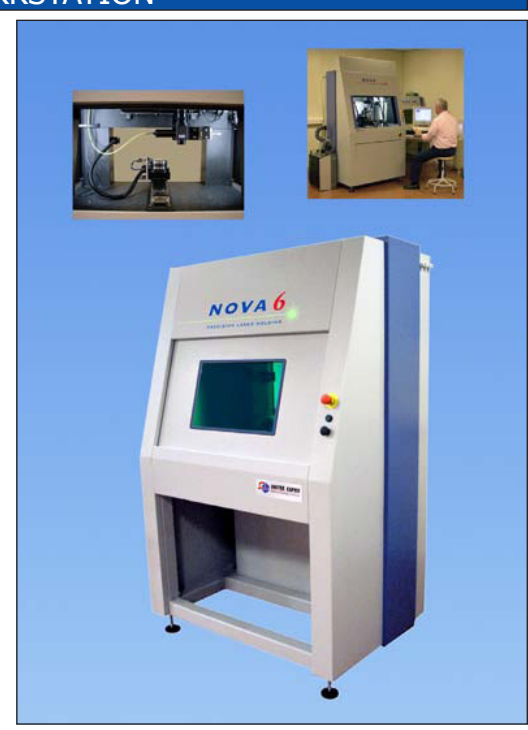
NOVA-6 CNC laser welding workstation

Advanced windows software IMS3000, standard on all workstations. Completely integrates, Vision, CNC Motion, Laser Programming, Partfile management, Remote service, Glovebox control and Datalogging modules